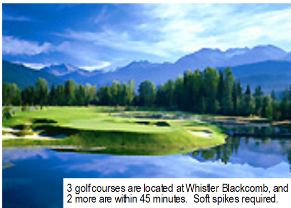
3 golf courses are located at Whistler Blackcomb, and 2 more are within 45 minutes. Soft spikes required.

Lodging and 3 meals/day are included in the package. Racers stay in condos in Blackcomb Village near base of lifts. Meals start with dinner on the day of arrival. Any meals during the 2 travel days are not included.