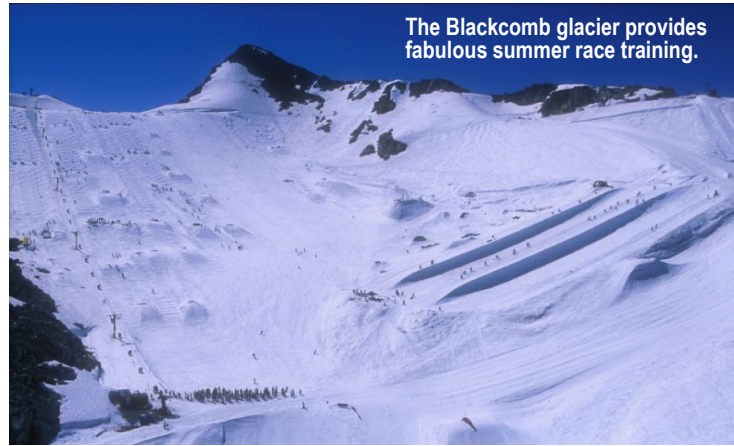
The Blackcomb glacier provides fabulous summer race training.