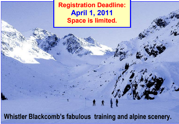
Whistler Blackcomb's fabulous training and alpine scenery.

Registration Deadline: April 1, 2011 Space is limited.